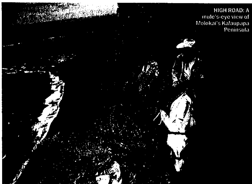
HIGH ROAD: A mule's-eye view of Molokai's Kalaupapa Peninsula

ISLAND STYLE The essential soundtrack for any sojourn in the islands must include tunes by the late "Bruddah Iz," chief among contemporary Hawaiian musicians. Born Israel Kama-kawiwo'ole on the island of Oahu, this ukulele-strumming ambassador of aloha was a massive force for native Hawaiian activism (quite literally, since he weighed more than 700 pounds when he died in 1997, at 38). His haunting rendition of "Somewhere Over the Rainbow" helped make his 1993 Facing Future the first ever Hawaiian music album to go platinum.